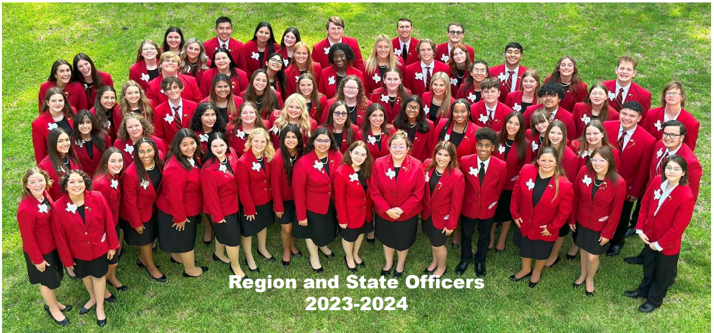
Region and State Officers 2023-2024

Plaques may be picked up in Peacock Terrace following the session.